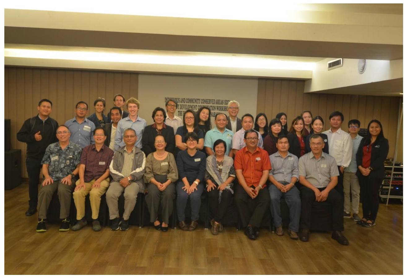
ICCA Strategy Development Consultation Workshop in December 2018, Kota Kinabalu, Sabah

In December 2018, UNDP's GEF-Small Grants Programme (GEF-SGP) in collaboration with PACOS Trust, a local non-governmental organisation, held a multi-stakeholder consultation workshop aimed at engaging relevant stakeholders, forming an ICCA working group and working towards developing a national ICCA strategy. The discussions held in this workshop have informed some of the aspects of this Legal Review.