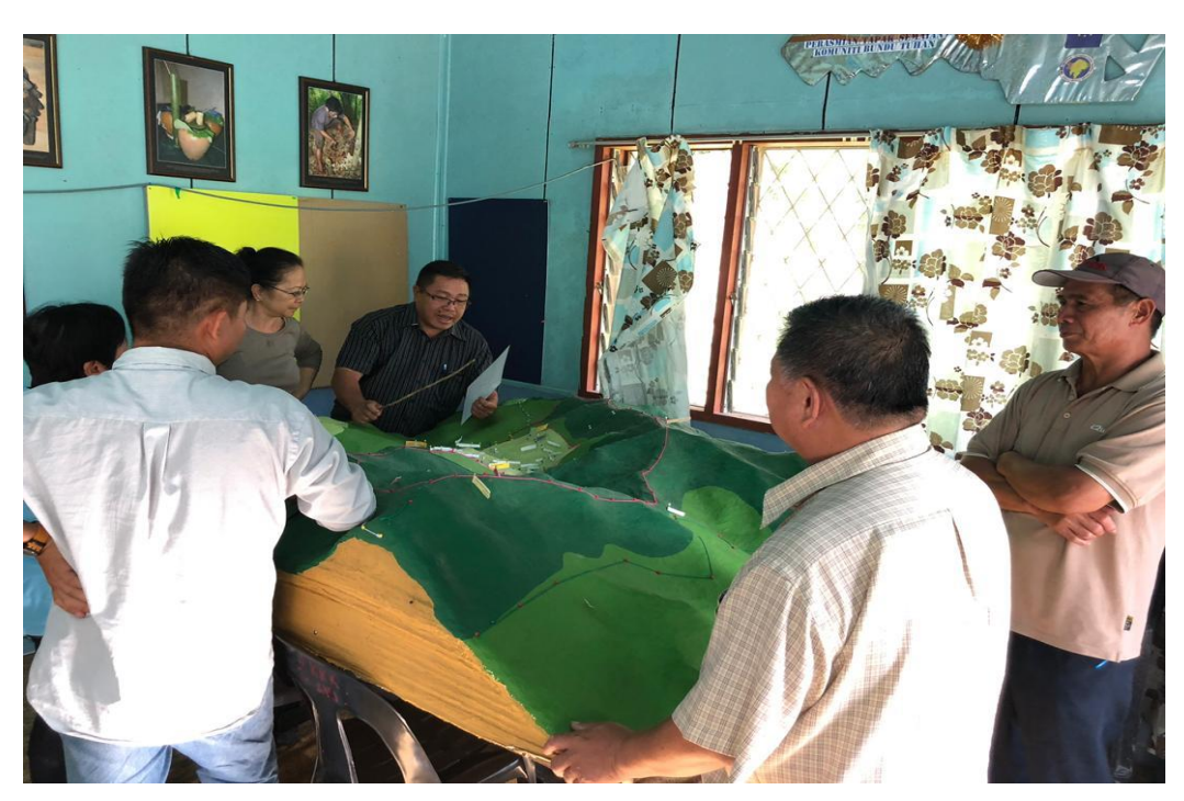
Photo: Field Work: Village elders explaining layout of the Bundu Tuhan ICCA.

Kinabalu-Ecolinc EU REDD+ project areas, such as Kampung Kiau Nuluh-Bersatu (Kota Belud District), Kampung Wassai and Kampung Tiong Simpodon (Tuaran District) replicating the concept.<sup>248</sup>